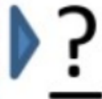
Figure 1. Our task for learning patch representations involves randomly sampling a patch (blue) and then one of eight possible neighbors (red). Can you guess the spatial configuration for the two pairs of patches? Note that the task is much easier once you have recognized the object!